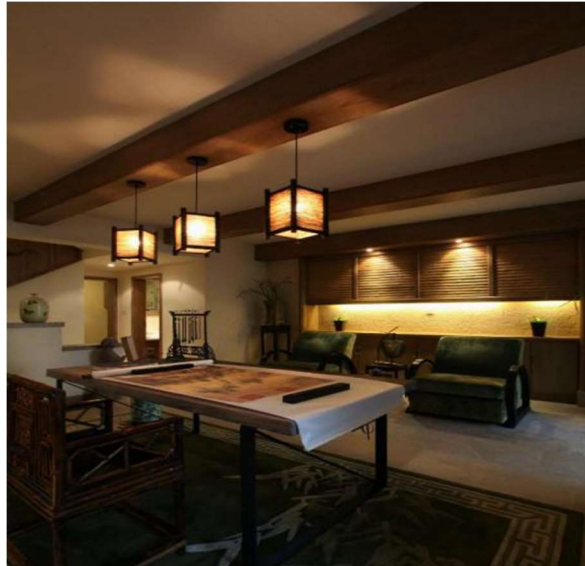
Fig. 3. The location of light source

People's visual feeling needs to be perceived through light source, and reasonable light source irradiation can change the atmosphere of space [6]. Light source through different Angle and direction, different lamp art decoration, different lighting conditions and tonal, the formation of different lighting intensity and color. Glass furniture with light-colored wood combination makes the space brighter and brings comfortable visual experience, see Fig.3.