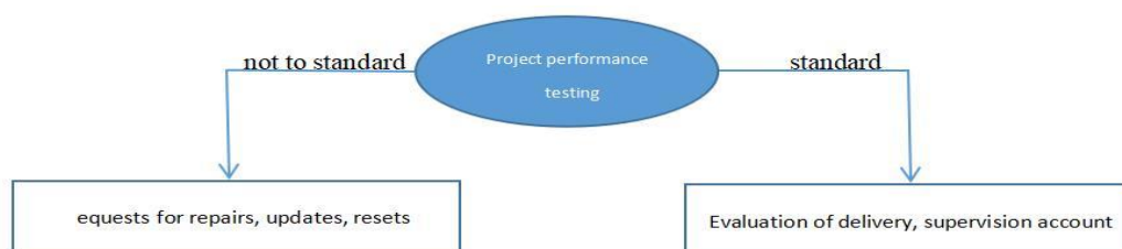
Figure 2. Performance Test of Auditing Department PPP Project

At this stage, the project company will give the project ownership and operation rights to the government. Because the government is the receiver of the project, supervision is undertaken by the public and independent third-party monitoring agencies:First, Regulatory transfer content is complete;Second, develop transfer standards and conduct one-on-one tests on the transferred contents;Third, conduct performance tests on the transferred projects (see “Fig. 2, ” for details);Fourth, to regulate the performance audit after the transfer, that is, to supervise the cost-effectiveness, public satisfaction, regulatory effectiveness, etc.